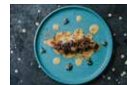
Poultry with cream