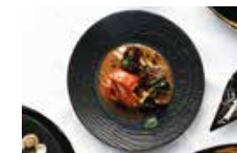
Lobster with morels